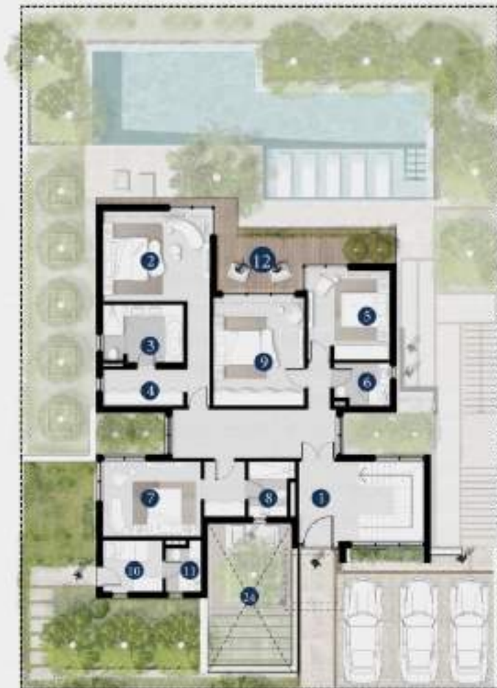
ENTRANCE FLOOR (BEDROOM OPTION)