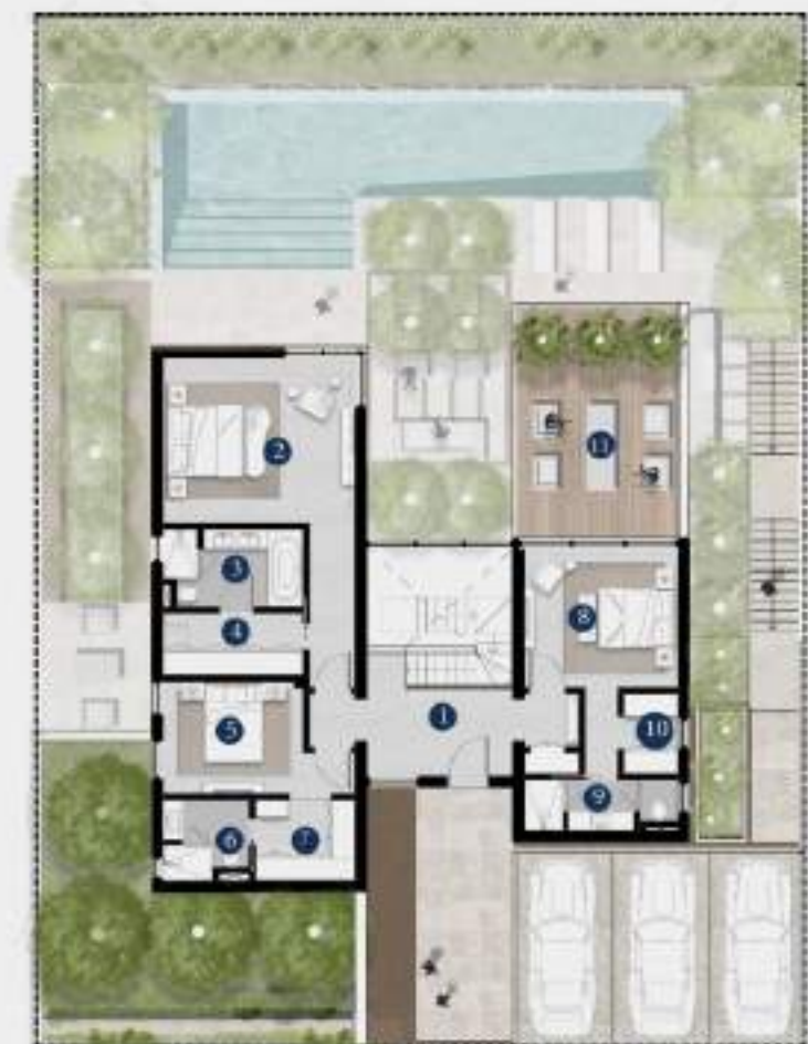
ENTRANCE FLOOR (BEDROOM OPTION)