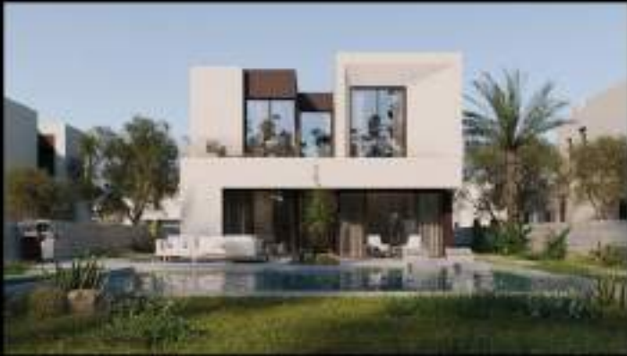
THE VILLA (2 FLOORS) 2